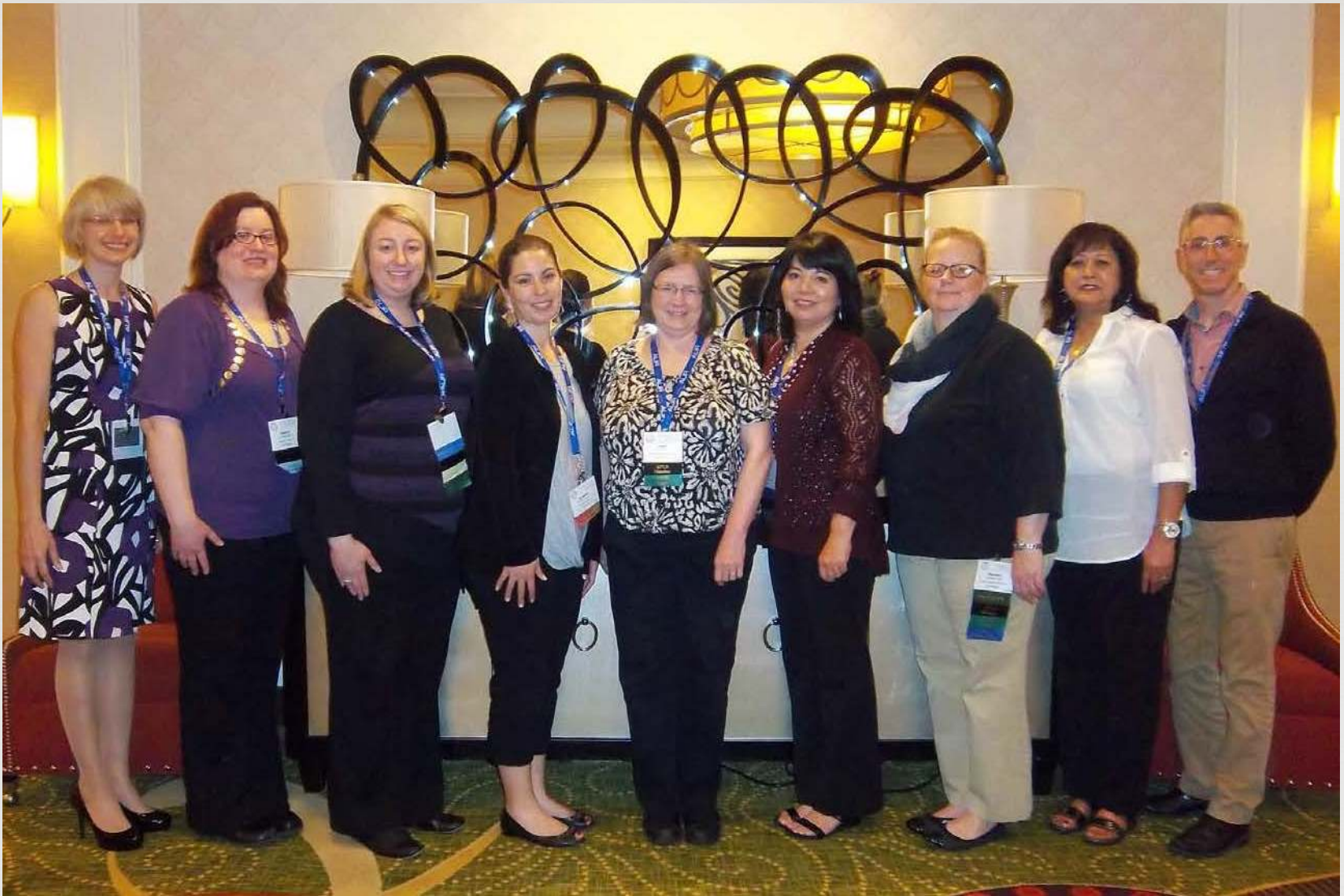
2015 -2016 APCR BOARD OF DIRECTORS