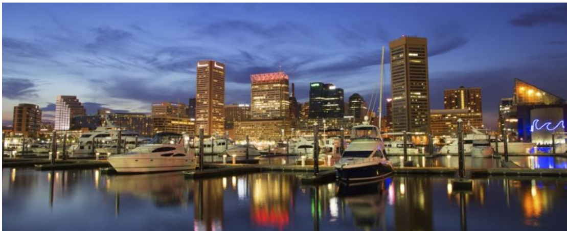
Baltimore Inner Harbor