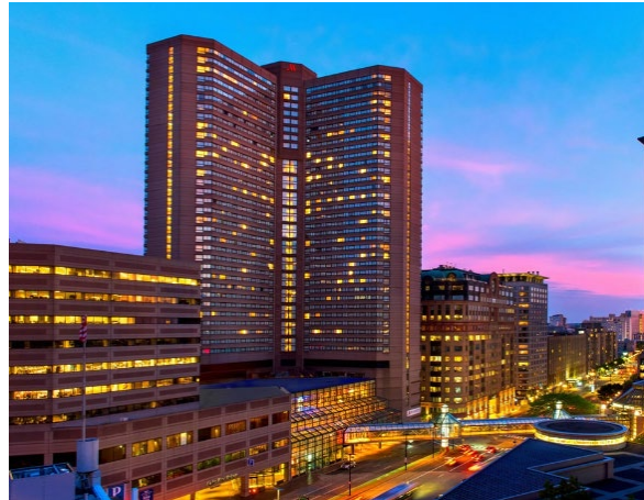
Marriott Copley Place

and Copley Place Mall. The hotel has been recently renovated and features amazing views from the comfortable guest rooms. The hotel features a 24-hour fitness center, an indoor pool, and a new M Club. To make a hotel reservation, please use the following link: Hotel Reservations The Boston Logan International Airport is the nearest airport to the meeting.